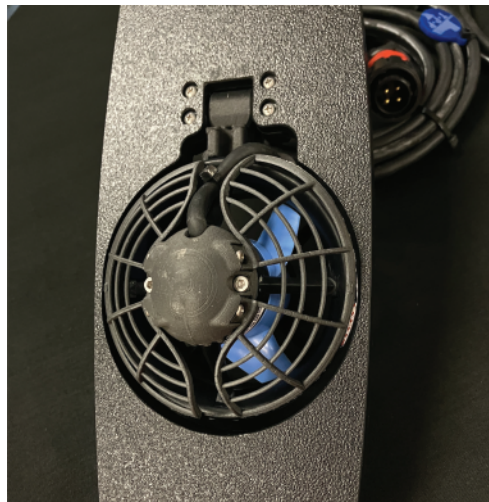
For Transducer Mounted Models