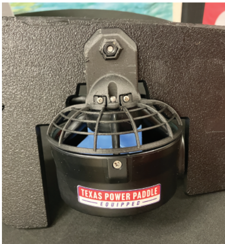
For Rudder-Integrated or Universal Models

Screw both screws firmly into place. Repeat on the other side.